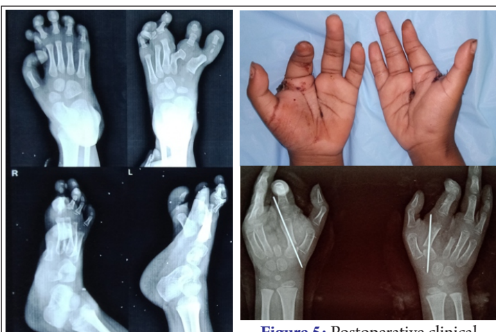
Figure 4: Anteroposterior and lateral radiographs of both feet