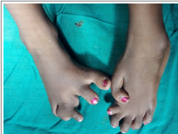
Figure 3: Clinical pictures of the feet