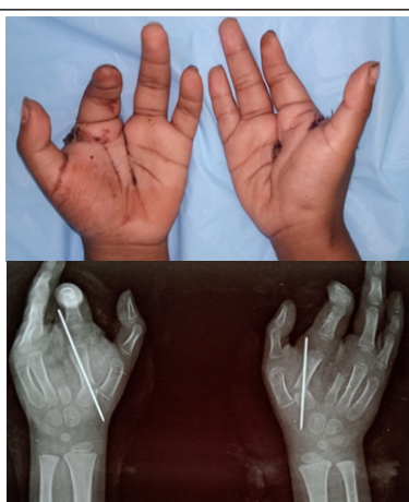
Figure 5: Postoperative clinical pictures and anteroposterior radiographs of both hands