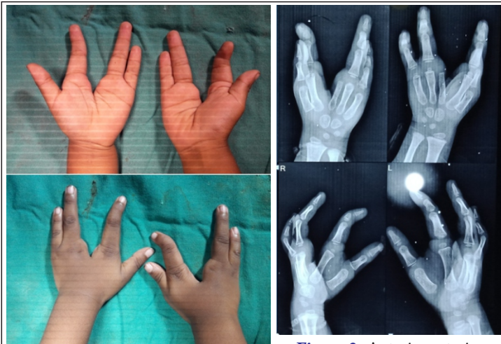
Figure 1: Clinical picture of split hand