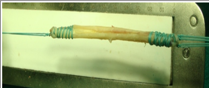
Figure 2 : Intra Operative pic of Tripled Semitendinosus Graft