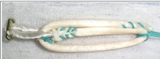
Figure 1 : Tripled Hamstring graft (from Book of Proddimos . The Anterior Cruciate Ligament, Reconstruction and Basic Science)